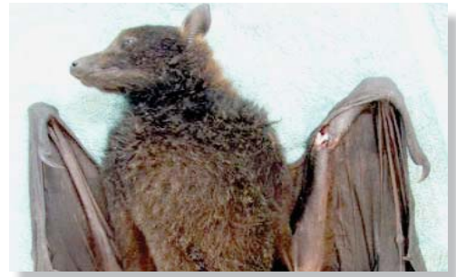
Shooting maimed, but did not kill, this young male flying fox.