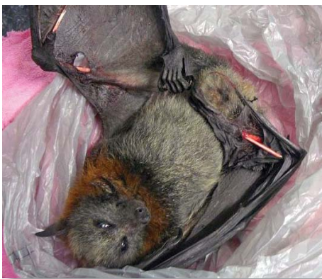
Grey-headed flying fox, a nationally listed threatened species left to die from multiple compound fractures from gunshot wounds.

The groups listed overleaf call on all Queensland political parties to commit to protecting native flying-foxes from threats to their conservation and welfare. There is no excuse for committing, allowing or encouraging cruelty to animals or for killing threatened species. We call on each political party to commit to the following: