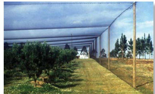
Full exclusion netting, the only humane and effective method of crop protection.