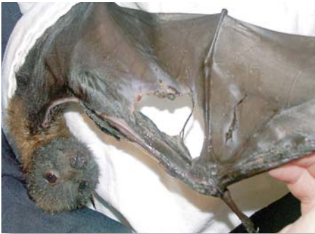
Orphaned, horribly burned but still alive - this baby shows the reality of electrocution.