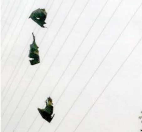
Spectacled flying foxes, a nationally threatened species, dead on a farmer's electrocution grid.